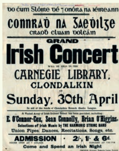
Original Poster for 1916 “Grand Irish Concert”